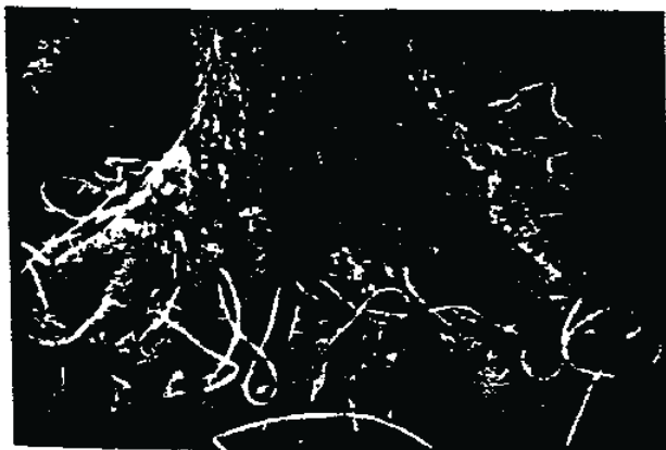
Fig. 1. Exposed-root-flare injection using about one injection site per 1.25 cm of diameter (two sites per inch).

When TBZ-P was root-flare (I) and trunk (III) injected in accordance with the highest preventive label rates, very low levels of chemical were detected and the trees were not resampled (Table 1). The 1977 (1-mo) bioassays indicated no difference in activity associated with differences in the volume of water used to inject the chemical at the therapy label rate (II and V). Percentage distribution and percentage of samples scored * were significantly greater with trunk injection (IV) than with root-flare injection (II) at the same dose and volume (Table 1). In 1978, only those trees that were trunk (IV) and root-flare (II) injected with the maximum therapy label rate were resampled. The levels of activity were about the same a year after injection as they were after 30 days with the preventive rate (I). After 13 mo, there was no longer a difference in the level of activity in these two groups.