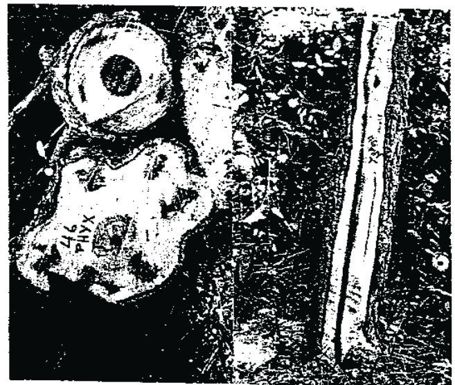
Fig. 3. Sections from a tree badly damaged by Phyton (HD). Left, cross sections at the root collar and 1 above; right, sapwood discoloration extending from injection point (arrow) through the first 1 m section of the tree.